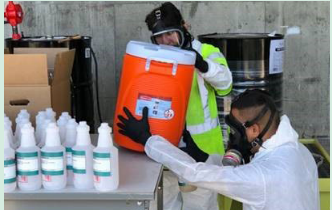
Outdoors, behind the warehouse, team members dress in Tyvek protective suits and respirators as they fill spray bottles from barrels of hand sanitizer.